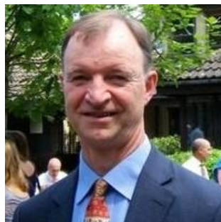
James Rogers Legal